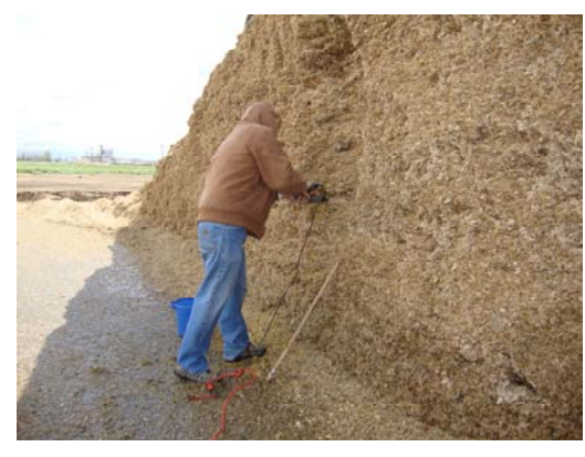
To measure density of the silage at the face, multiple holes must be drilled and corings removed and weighed. Locations are determined by practicality and safety.