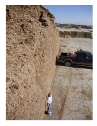
The primary concern when working around the face of a silage face should be safety. RESPECT THE SITUATION.!