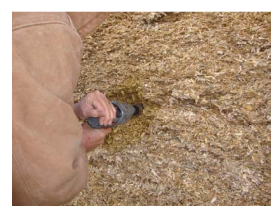
The coring drill is a standard size so by knowing the depth of the hole and weight of the silage removed from the hole, density can be calculated using a spreadsheet