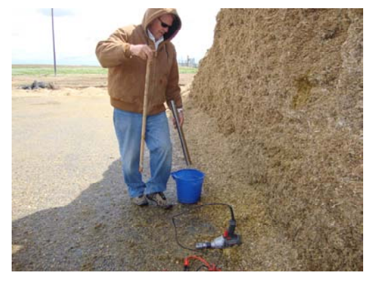
The most accurate measurements of packing density will come from corings taken within the top few feet of the silage pile. Samples taken lower are affected by compaction.